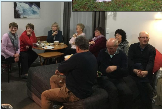
The "Roadie" group relaxing