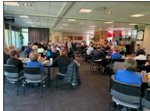
Enjoying lunch at the open day