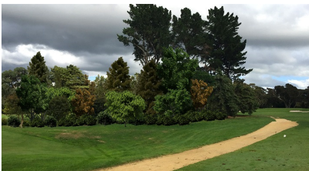
Potential view from the 11 th Blue tee

See the artist impressions below of what this area could look like.