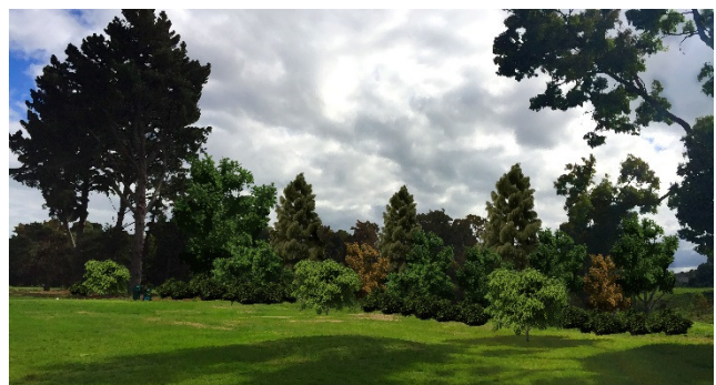
Potential view from the 12 th White tee