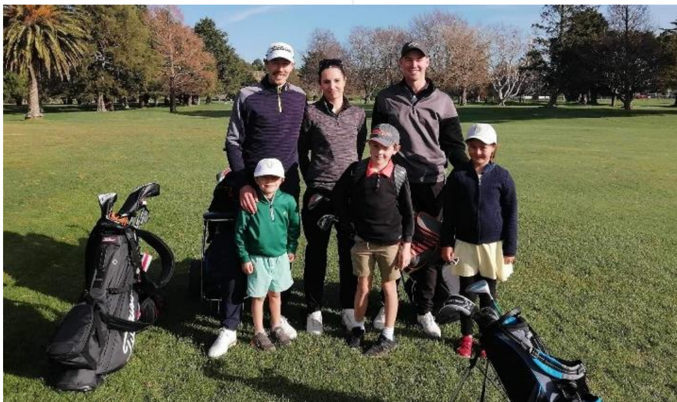
One particularly happy group ready to tee off for the Mid-winter Christmas nine-hole tournament.