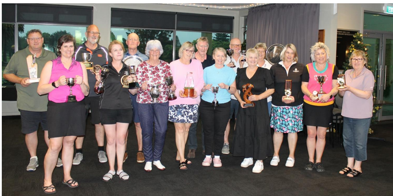
Above: 9-Hole Prizegiving Recipients 2023