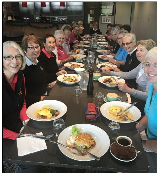
Women's Pennants Breakfast