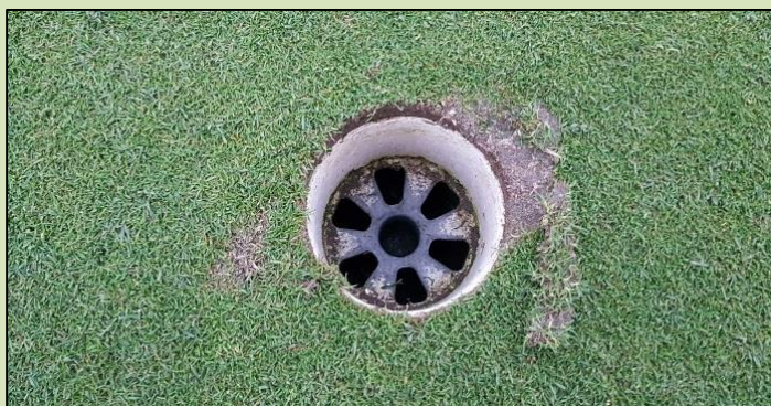
Damage to the pin hole on the 13th

Please repair pitch marks and replace all divots. On another note this happened on the Saturday 23rd June, I've put this up here instead of humour just to show others that haven't seen it. If you see anyone doing damage or abusing the course please let us know, remember that it is everyone's course and we all should enjoy it.