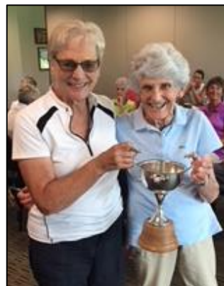
Marj Crystall Cup Winners