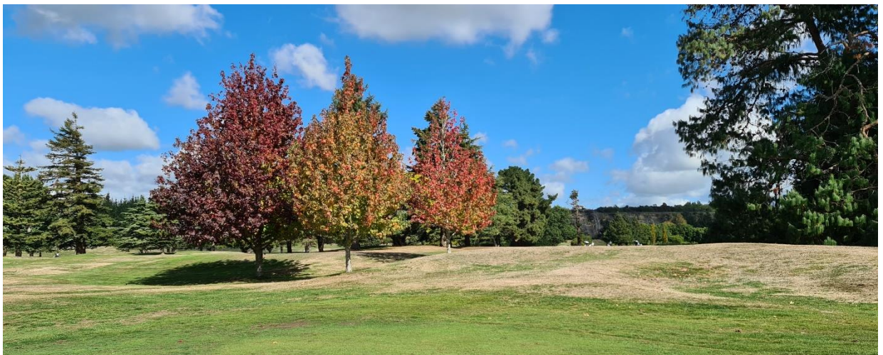
Autumn trees on the 18 th fairway.