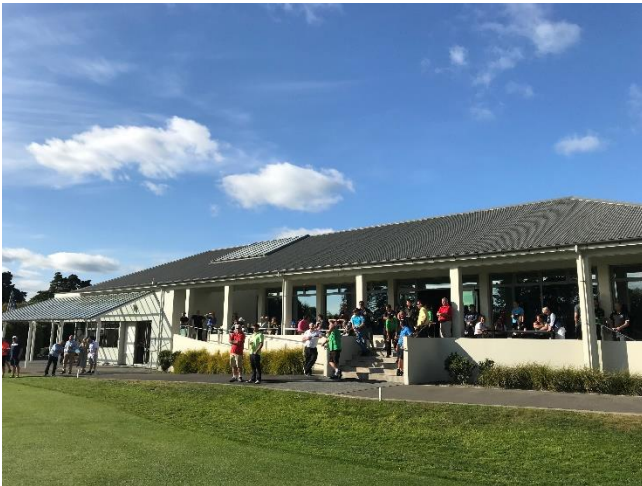
Crowd watching the play off