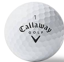
Callaway Ball Selector

Just remember if you have any questions regarding your game please don't hesitate to ask us, we are here to help!