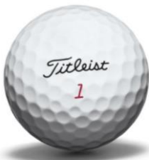
Titleist Ball Selector