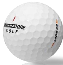
Bridgestone Ball Selector