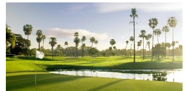
Sanctuary Cove - Queensland

Please enjoy the opportunity to play at some magnificent golf courses.