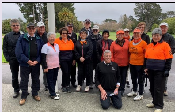
Friday 13 th – Black and Orange