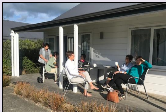
Saturday 9 Hole Ladies in Eketahuna