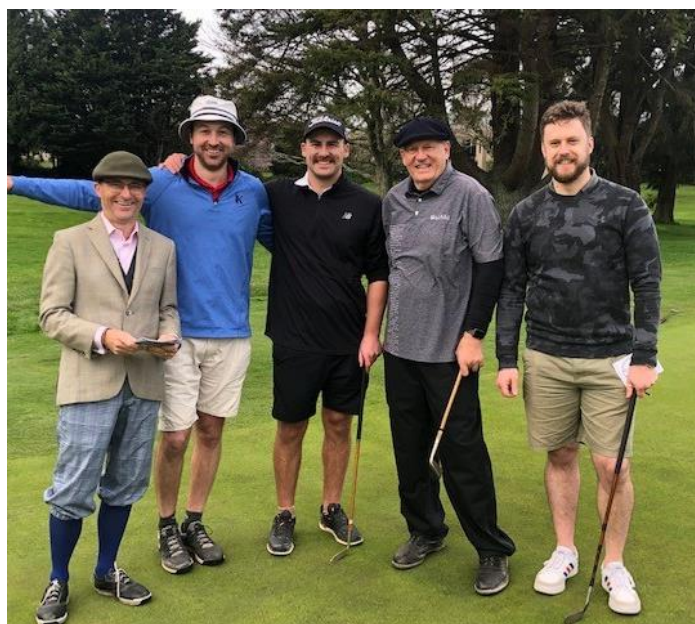
Devil's Own players